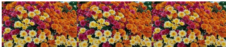
BUMC Day school Mum Fall flower sale