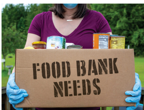
Lighthouse Food Pantry Collection for the month of February: skillet dinners

All in all, 2021 was a year of blessing in spite of the global pandemic! God is so good! In January of 2021, probably none of us could have imagined what the year would bring. None of us knows what God has in store for us in 2022. There is one sure thing, though. The Bakerstown Mission Team is excited to discover how God is calling our congregation to serve next!