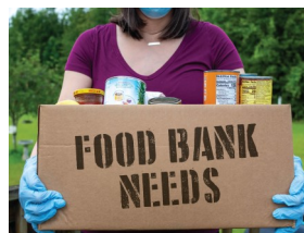
Lighthouse Food Pantry Collection for the month of July & August: Canned Tuna and Canned Chicken